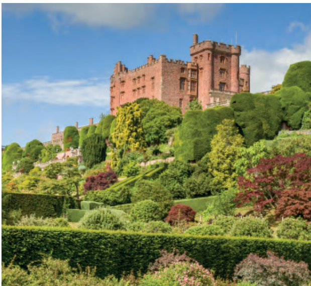
Powis Castle and Gardens, Powys

The focus of many local legends, Mitchell's Fold is a Bronze Age stone circle set in dramatic moorland on Stapeley Hill. It once consisted of some 30 stones, 15 of which are still visible.