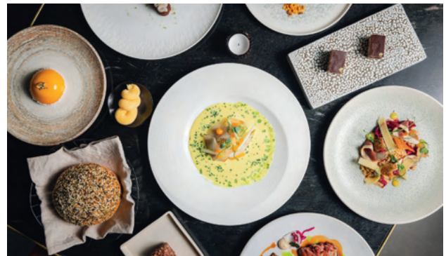
The Walrus, Shrewsbury