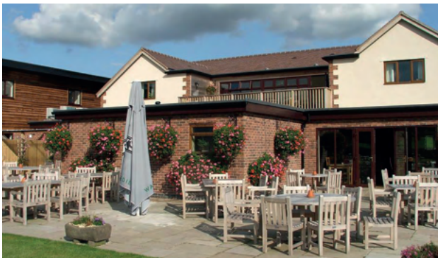
The Lowfield Inn, Marton