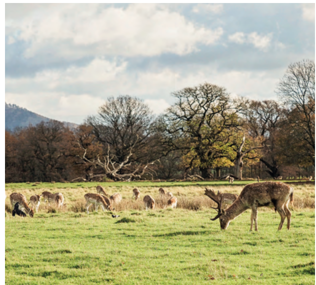
Attingham Park, Shrewsbury