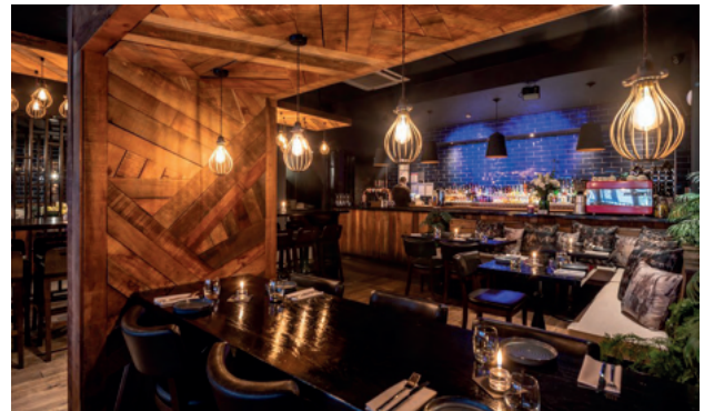
House of the Rising Sun, Shrewsbury