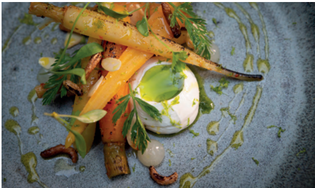
The Checkers, Montgomery