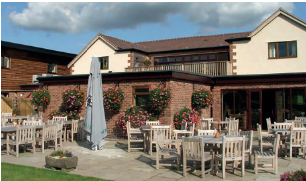
The Lowfield Inn, Marton