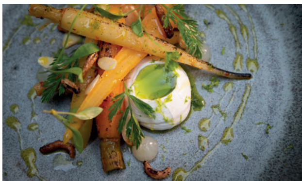
The Checkers, Montgomery