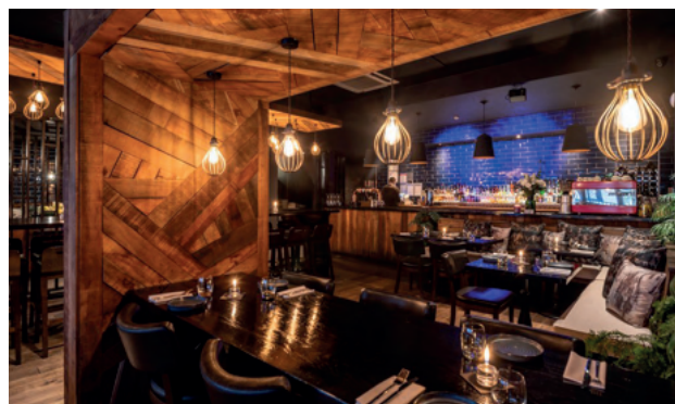
House of the Rising Sun, Shrewsbury