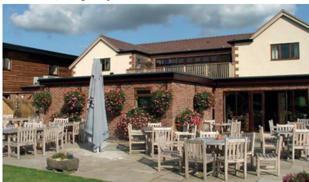
The Lowfield Inn, Marton