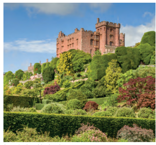
Powys Castle and Gardens, Powys

The focus of many local legends, Mitchell's Fold is a Bronze Age stone circle set in dramatic moorland on Stapeley Hill. It once consisted of some 30 stones, 15 of which are still visible.