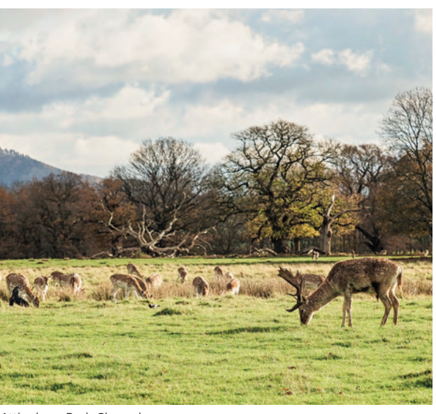
Attingham Park, Shrewsbury