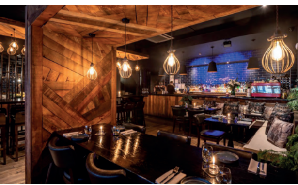
House of the Rising Sun, Shrewsbury