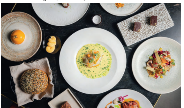
The Walrus, Shrewsbury