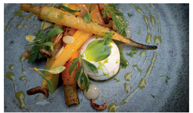
The Checkers, Montgomery