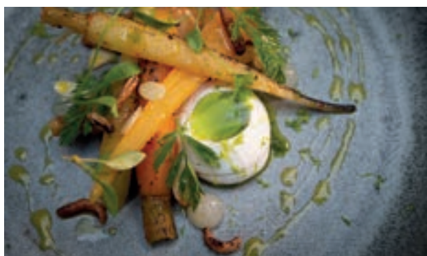
The Checkers, Montgomery