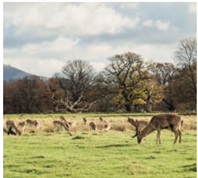
Attingham Park, Shrewsbury