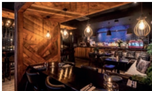
House of the Rising Sun, Shrewsbury