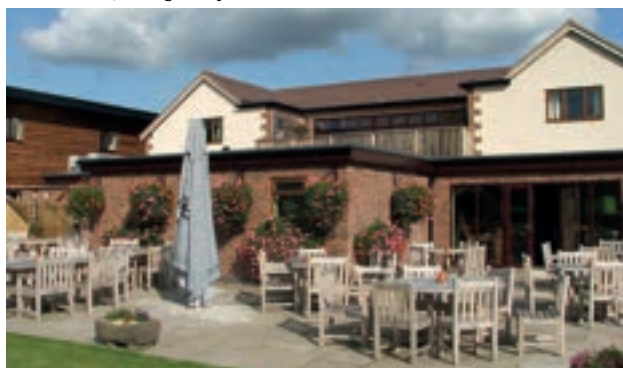
The Lowfield Inn, Marton