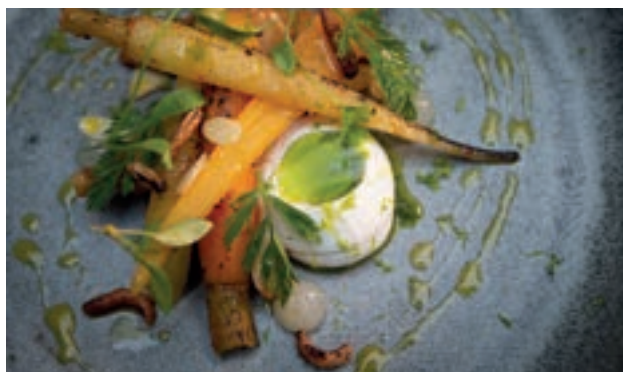
The Checkers, Montgomery