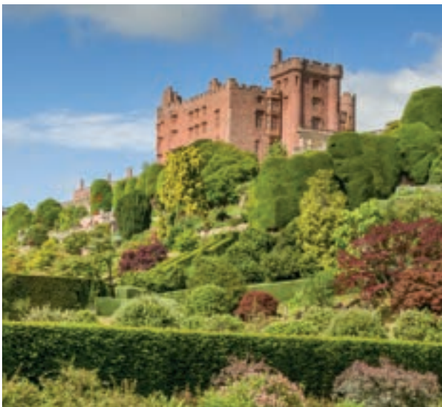
Powys Castle and Gardens, Powys

The focus of many local legends, Mitchell's Fold is a Bronze Age stone circle set in dramatic moorland on Stapeley Hill. It once consisted of some 30 stones, 15 of which are still visible.