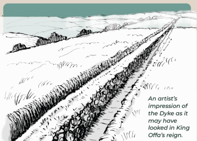
An artist's impression of the Dyke as it may have looked in King Offa's reign.